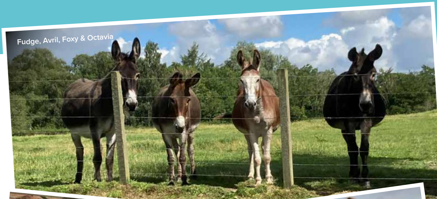
Fudge, Avril, Foxy & Octavia

The Donkeys are all very well and although they undoubtedly miss the interaction with the visitors, have come through the COVID period none the worse.