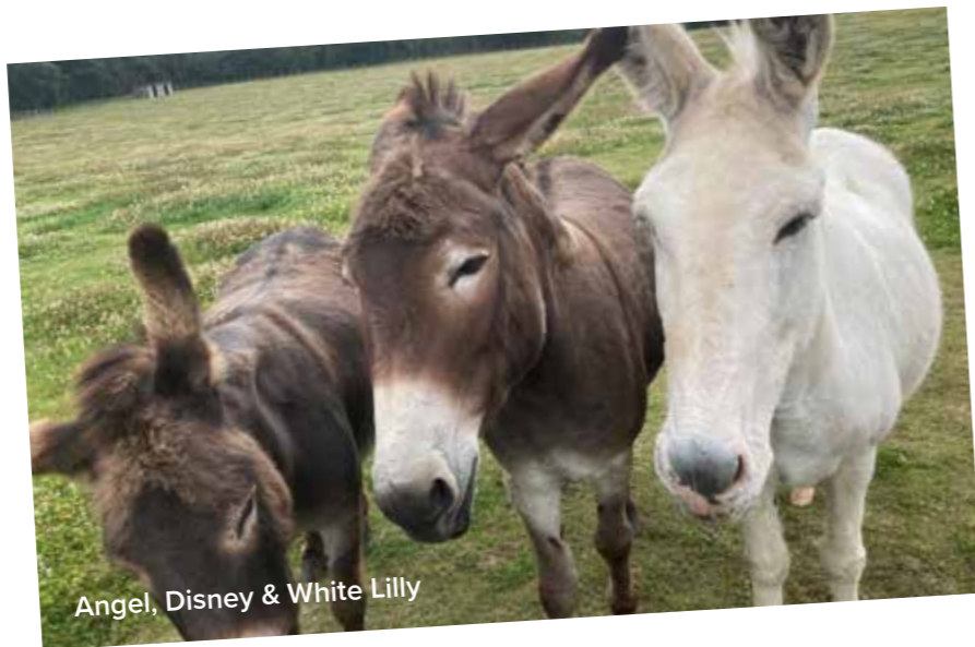
Angel, Disney & White Lilly

Following a chilly dry April, with little or no grass to graze on, we had to continue supplementary feeding of hay and concentrates for a month to six weeks longer than normal. Of course when the grass did decide to grow it shot up in a great abundance but we were suddenly surrounded by the most alarming amount of Buttercups that I have ever seen in the Donkey paddocks. Dealing with Buttercups is a very tricky business as you can't shut off and spray all the affected fields or there would be no grazing available for the Donkeys. We eventually topped all of the worst affected fields and gave the grass a chance to grow.